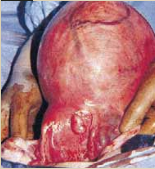
Opt for abdominal bysterectomy when a considerably enlarged uterus due to numerous fibroids is encountered.