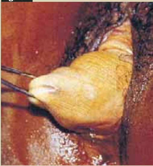
Choose the vaginal route when pelvic support defects are present, but bear in mind that the course of the ureter changes due to prolapse.

promise upper abdominal exposure but are more cosmetically appealing than vertical incisions. Each of these involves a lower abdominal transverse skin incision and a transverse fascial incision. With the Pfannenstiel technique, the rectus fascia is separated from the rectus muscles, and the muscles are split vertically in the midline, allowing access to the peritoneal cavity. This is the quickest transverse incision to make but provides the least exposure.