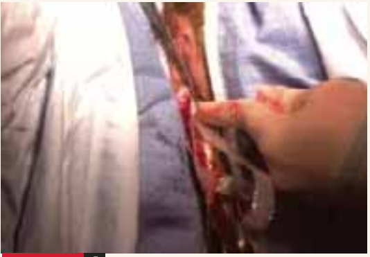
FIGURE 4 Push the tape through the retropubic space, keeping the trocar in close contact with the posterior surface of the pubic bone.