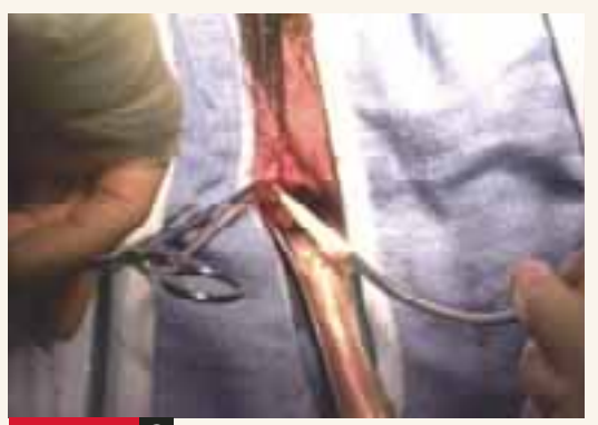
FIGURE 3 Place TVT trocars through the vaginal incision. Place abdominal guides suprapubically and attach them to the TVT trocar tip.