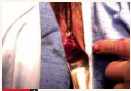
FIGURE 1 Place a Sims speculum into the vagina and make a vertical incision 1.5 cm from the external urethra meatus.