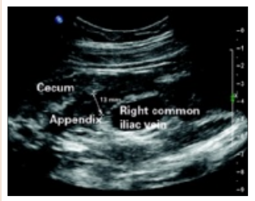
Longitudinal view by ultrasound of enlarged appendix with diameter equal to 13 mm (normal is <6 mm).