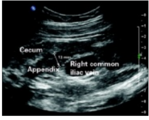
Transverse view of inflamed appendix by ultrasound in the cecum and no movement in the appendix, indicating obstruction or inflammation.

with wall thickening. Ultrasound showed peristalsis