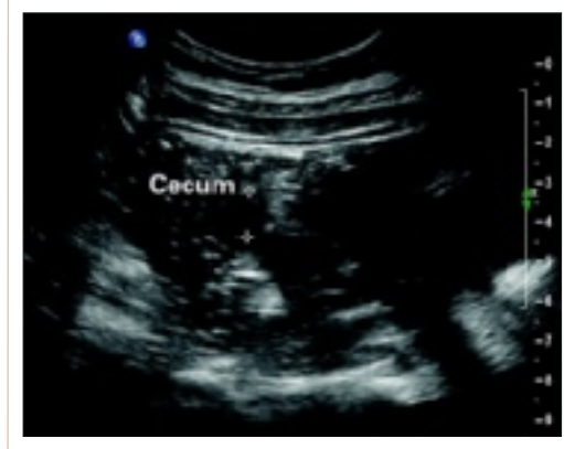
A second, graded compression ultrasound was obtained, rather than a CT study, to avoid exposing the fetus to radiation.