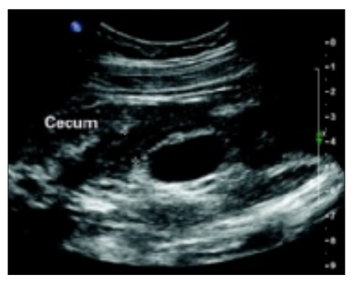
Ultrasound view of the right lower quadrant with cecum labeled.