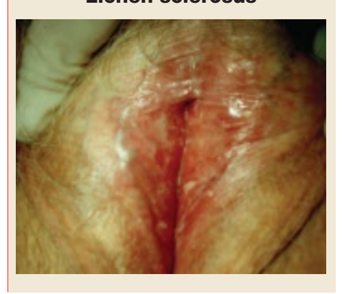
Note the labial agglutination (labia minora) and diffuse white epithelium, which are characteristic findings. If the areas of thickened epithelium do not resolve with topical steroid ointment, biopsy is appropriate.

Women with lichen sclerosus are at increased risk for persistent vulvar yeast infection and squamous vulvar cancer.