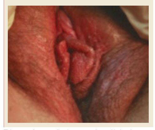
This case of severe allergic contact dermatitis has been aggravated by chronic scratching, especially of the left labia. Cases typically are much more subtle.

Not all women with vulvar allergic dermatitis have atopy at other body sites. Hyperkeratosis and spongiosis in the pathology specimen are characteristic. A small (3- or 4-mm) biopsy at the most symptomatic site is appropriate in any woman with chronic vulvar pruritis.