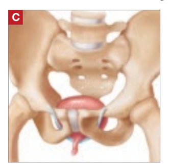
Transobturator tape (TOT) technique