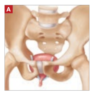
Tension-free vaginal tape (TVT) technique