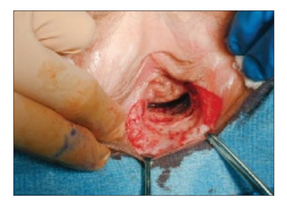
Vestibulectomy involves removal of the entire vestibule except the part just lateral to the urethral meatus.