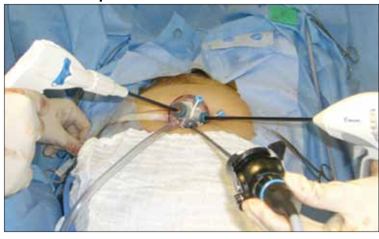
Desired triangulation of instruments in SPLS setup.

(Applied Medical) – a system constructed of synthetic gel material and consisting of a "GelSeal" cap, cannulas, and seals to accommodate 5-mm to 10-mm instrumentation ( FIGURE 4 , page 30).