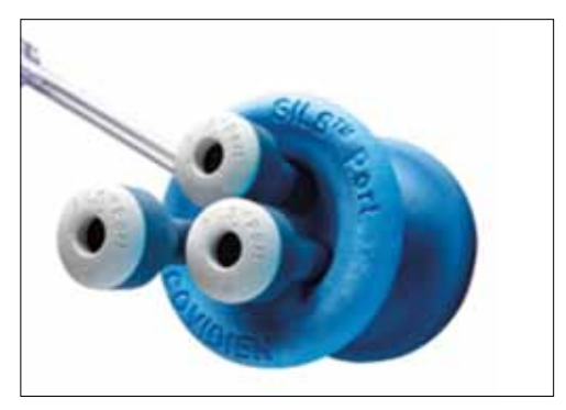
The SILS Port is a soft, flexible, three-channel port that allows for placement of blunt trocars ranging in size from 5 mm to 12 mm.