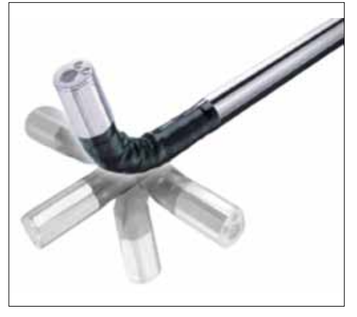
A flexible-tip laparoscope ensures good visualization of the surgical field.