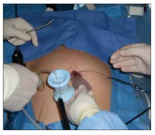
In this case, the specimen was placed in a 10-mm EndoCatch bag and removed through the 10-mm cannula of the SILS Port.

morcellator) for complete visualization (note: Covidien does not recommend this usage).