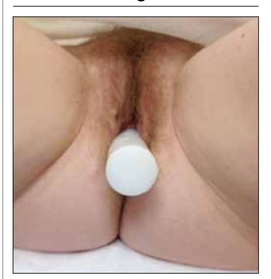
Tell the patient to lie on the bed with her knees bent and to insert the lubricated dilator into her vagina as far as it will go without causing pain.

lubricated dilator in the vagina as far as it can go without causing any pain (FIGURE 1). It may be helpful for her to bear down when first inserting the dilator. An in-and-out motion is not necessary.