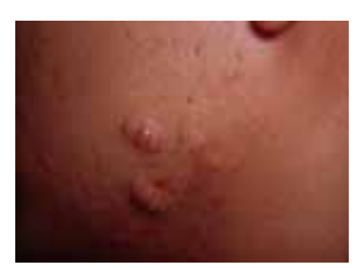
Nodular (inflammatory) Nodule: bump greater than 5mm in diameter.

Papulo-pustular (inflammatory) Papule: small bump less than 5mm in diameter. Pustule: smaller bump with a visible central core of purulent material.