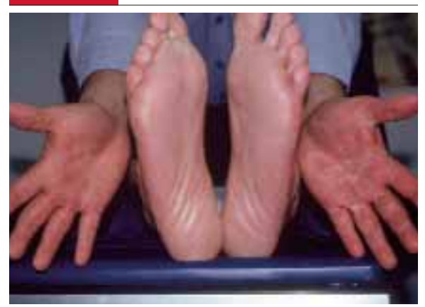
The common "1 hand, 2 feet" syndrome of tinea pedis. This syndrome usually requires systemic therapy.

normal, rough hands. Unilateral involvement, presence of fingernail onychomycosis, lack of history indicating irritant or allergen exposure, and absence of psoriatic nail changes should increase the suspicion of palmar tinea manuum.