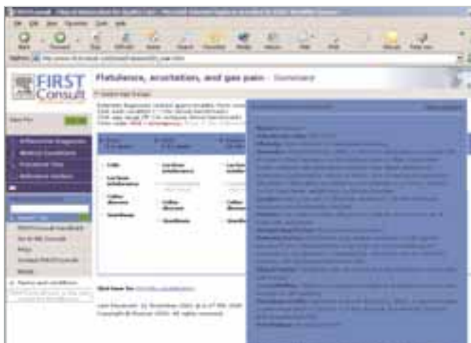
FIGURE 4 Summary of a Differential Diagnosis

Illustration of a Summary page in the Differential Diagnosis section. Differential diagnoses are listed in approximate order of frequency by age. Adult (18–45), Middle Age (45–65), and Senior Adult (65+) columns are covered by the diagnosis summary for “Irritable bowel syndrome,” produced by clicking that diagnosis in any of the lists for ages 18 and older.