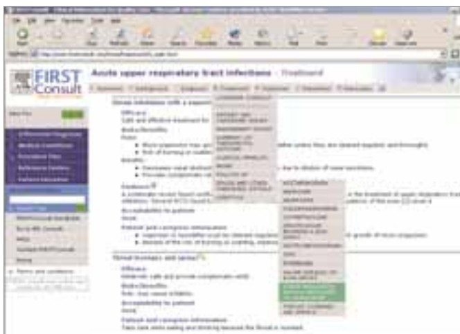
FIGURE 5 Typical FIRSTConsult monograph

Main subsections of a monograph appear across the top. Floating the cursor over each section produces a drop-down menu that, in turn, produces submenus as the cursor is floated over choices. In this case, the cursor was sequentially floated over Treatment, then Drugs and other Therapies, and the highlighted item selected.