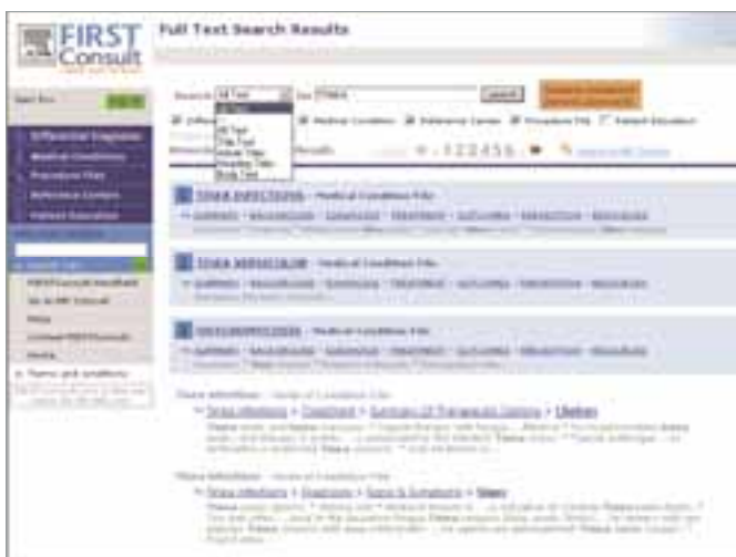
FIGURE 2 Typical FIRSTConsult search screen

A global search for “tinea” produces 529 retrievals (covered by drop-down list). Users modify searches using check boxes across the top or with the drop-down list. Major monograph retrievals are highlighted and users can click directly through to a section of interest (eg, Summary or Treatment).