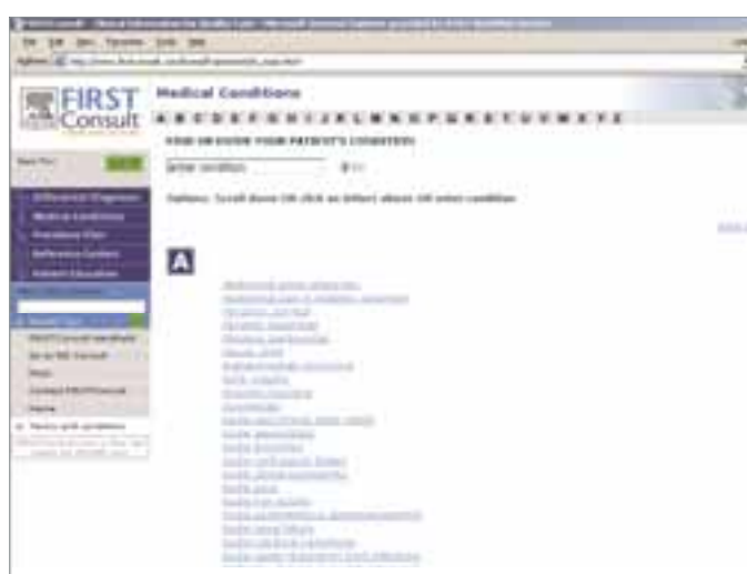
FIGURE 3 Medical Conditions

Opening screen of the Medical Conditions section. Users may jump to the desired section with the alphabetic listing across the top, or may choose to use the scroll bar, or may employ the search box at the top of the screen to search just the Medical Conditions section. (The search box at left still functions as a global search.)