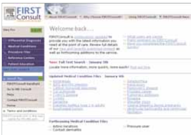
FIGURE 1 FIRSTConsult’s opening screen

FIRSTConsult’s opening screen, allowing one-click access to each of its 5 major sections, plus a global search feature (all on the left of the screen).