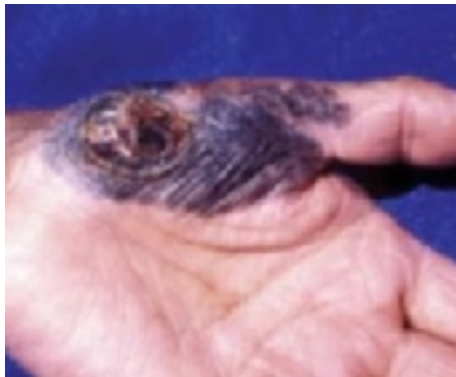
Acral melanoma lesion on the hand.