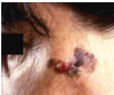
Desmoplastic melanoma lesion, commonly found on the head and neck.