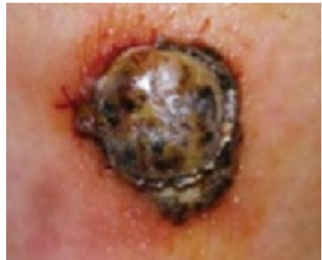
Nodular melanoma often exhibits aggressive vertical growth.