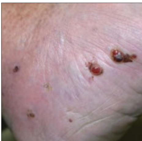
Painful papules and nodules

An 88-year-old Caucasian man of Italian ancestry came into the clinic with multiple, painful purple-red papules and nodules on the dorsal and plantar surfaces of his left foot.