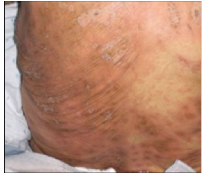
Characteristic diffuse erythematous macules with necrotic centers and overlying blistering on the back of a patient with Stevens-Johnson syndrome.