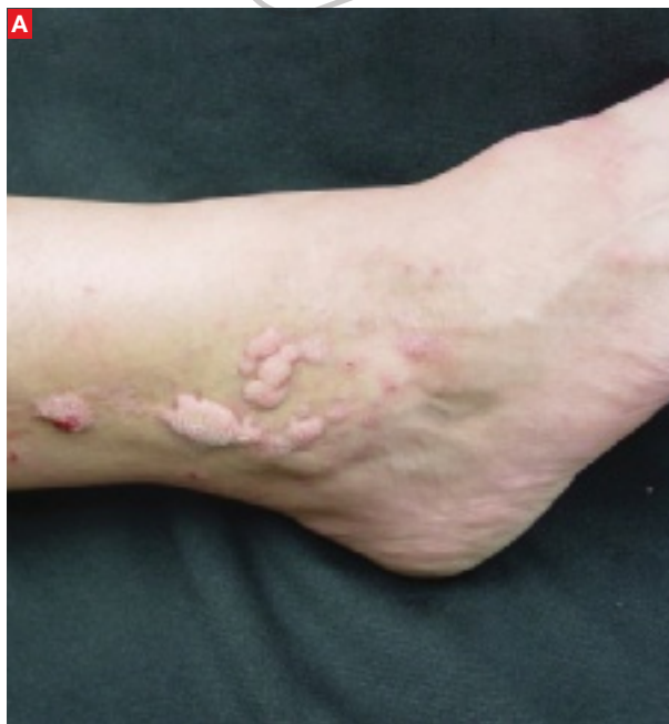
Multiple pruritic, scaly nodules