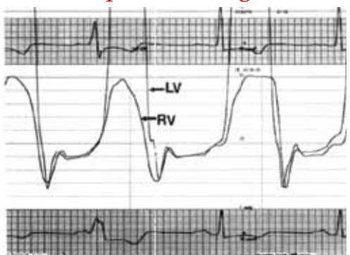
FIGURE 3 Classic square root sign

physema, and pleural plaques. A transthoracic echocardiogram performed a week earlier was significant for a normal ejection fraction without pericardial thickening, and mild dilation of the left and right atria and the right ventricle.