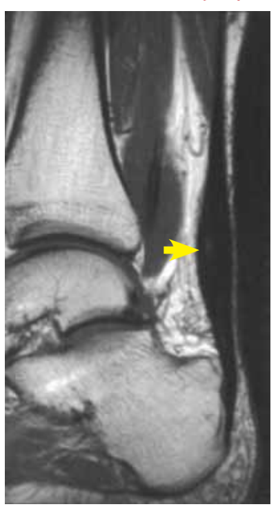
An MRI reveals anterior bulging and thickening of the Achilles tendon (arrow) the type of injury you might see in a patient using the Wii Fit exercise pad for running and stretching.

movement.<sup>31</sup> Patellar and olecranon bursitis are most frequently associated with sports, particularly soccer and golf.