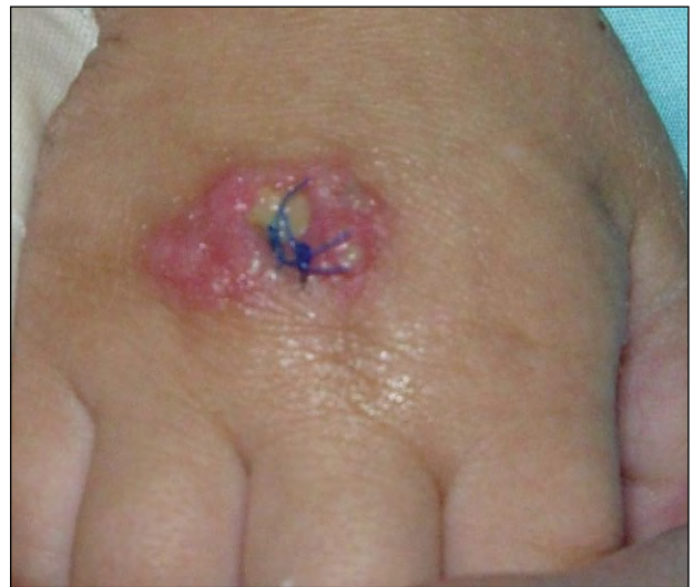
Figure 1. Pink, erythematous, sharply demarcated nodular plaque on the dorsal aspect of the right hand; biopsy sutures were present.

Clinical findings in PCA vary depending on the time of presentation but typically include cellulitis, erythematous patches or plaques progressing to ulceration and eschar formation, 5,7 hemorrhagic bullae, 2 nodules, 4 and pustules. 3 Due to the spectrum of presentation in cutaneous aspergillosis, the differential diagnosis can be extensive and is dependent