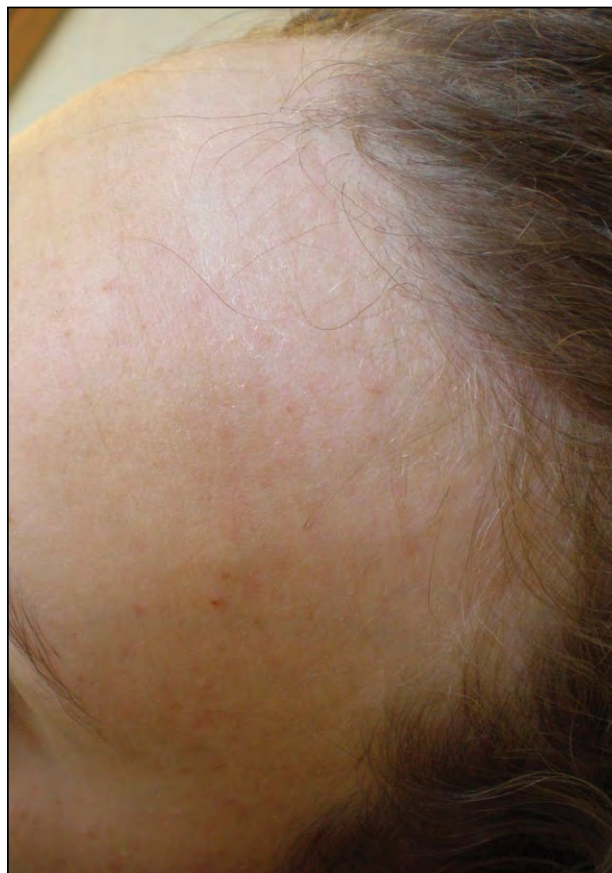
Figure 1. A bandlike area of symmetric hair loss involving the frontoparietal area of the scalp.

The etiopathogenesis is largely unknown. A T cell-mediated autoimmune reaction appears to play a major part. 5,10 Hormonal influence also has been suggested considering the predominance in women as well as usual postmenopausal onset. However, hormonal disturbances were not found in the laboratory test results of the patients reported in the literature, and hormone replacement therapy did not prevent the development of this condition. 3,5,6,9 Our patient did not report any gynecologic disturbances. Hormonal assays performed were within reference range.