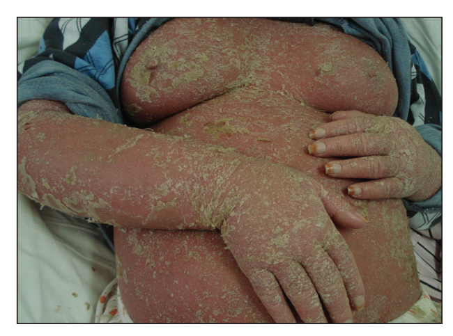
Figure 3. Severe widespread erythema, scaling, and edema in a 26-year-old woman with psoriasis.