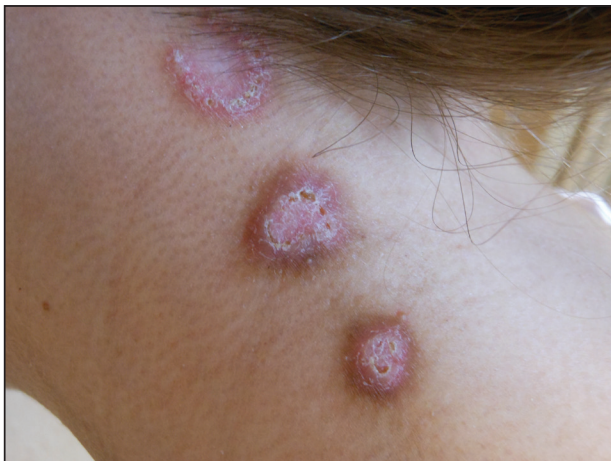
Figure 1. Nummular plaques on the left side of the lateral neck.

Elastosis perforans serpiginosa lesions classically present as asymptomatic, serpiginously arranged, hyperkeratotic papules, nodules, and annular plaques in young adults and children. Lesions usually present on the neck, though other locations have been described. Histologically, transepidermal elimination