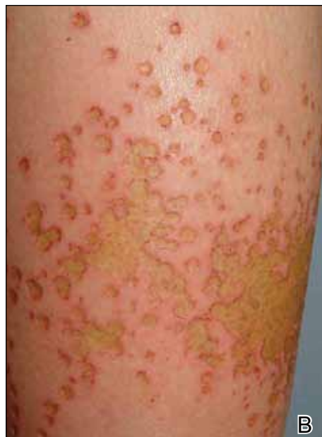
Figure 1. Multiple confluent, punchedout, round ulcers with peripheral erythema on the thighs and shins (A and B).

in the following months with scar formation and hyperpigmentation.