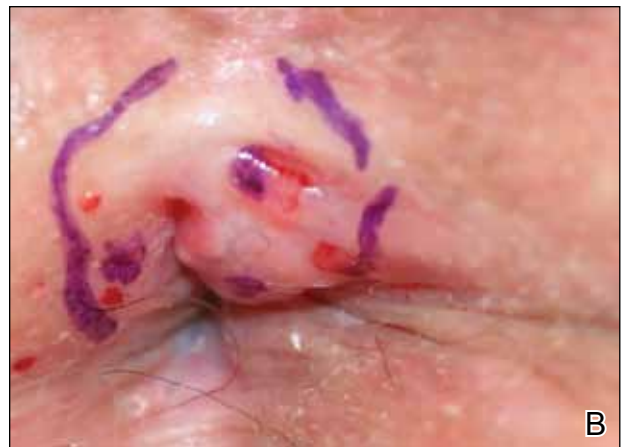
Figure 2. A 2×1-cm erythematous scaling patch on the right anal verge (A). Clinical resolution of erythema and scaling was achieved following treatment with imiquimod and 5-aminolevulinic acid-based photodynamic therapy (B).