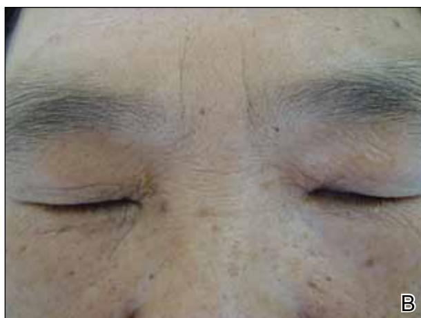
Figure 1. Clustered flesh-colored papules on both upper eyelids; the centers of the papules were filled with black keratinous plugs (A). Following treatment with levothyroxine sodium, most of the skin lesions had resolved (B).