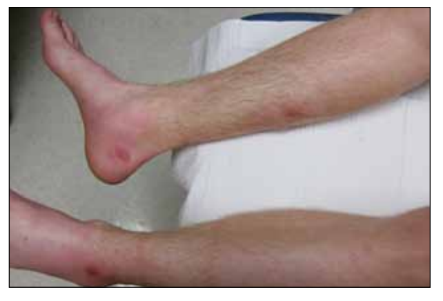
Figure 1. Tender erythematous nodules on the bilateral heels, ankles, and shins.