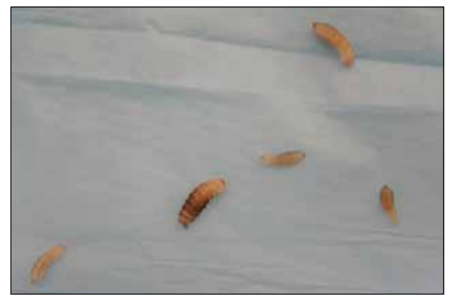
Figure 3. Dead larva extracted by lidocaine injection and punch biopsy.