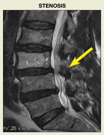
Sagittal L3-4 T2 MRI showing degenerative changes, including disc bulging, loss of disc height, facet and ligament hypertrophy, and grade 1 spondylolisthesis at L3-4, producing spinal stenosis.

ate degenerative LSS have a favorable natural history and rarely suffer rapid or catastrophic neurologic deterioration.<sup>1</sup> However, functional limitations that typically occur with moderate or severe LSS can be life-altering.