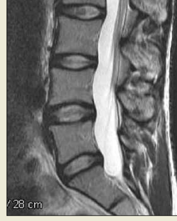
Sagittal T2 MRI showing normal lumbar lordosis with spacious spinal canal