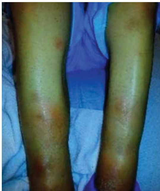
Figure 1. The patient had multiple raised erythematous nodules on the lower extremities consistent with panniculitis.

The syndrome mimics rheumatologic disease, often presenting without abdominal pain