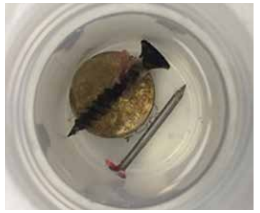
A coin, nail, and screw were successfully removed from the right main stem bronchus.

can be a valuable option for foreign objects removal, especially those distally located in the lung segments as well as in those medical centers where rigid bronchoscopy is not available.