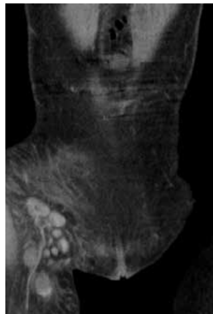
FIGURE 1 CT scan from admission was revealing

The patient's computed tomography scan showed enlarged right inguinal lymph nodes with fatty stranding.