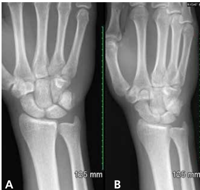
FIGURE 2 Healing at 4 weeks

Anteroposterior (A) and oblique (B) x-ray views of the wrist at Week 4 after injury demonstrate minimal interval healing of the longitudinal nondisplaced fracture of the triquetrum and resolution of the soft-tissue edema.