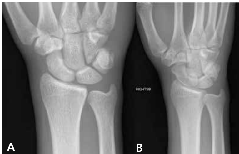
FIGURE 3 Continued healing at 8 weeks

Anteroposterior (A) and oblique (B) x-ray views of the wrist at Week 8 after injury demonstrate continued osseous healing of the longitudinal ulnar aspect of triquetral fracture. Fragments are in unchanged alignment.