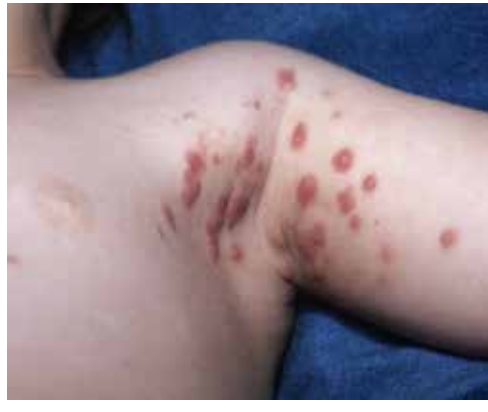
FIGURE 3 Nodular scabies in underarm