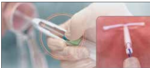
FIGURE 4 Moving the blue and green sliders downward together to release the IUS

resistance when the IUS is at the fundus and the flange should be flush against the cervix.