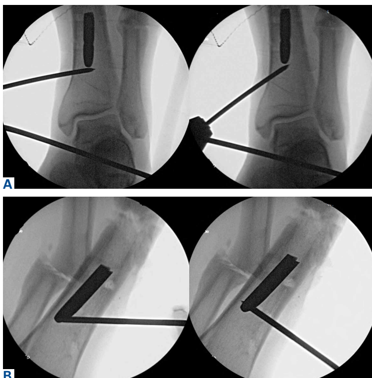
Figure 3. (A) Anteroposterior and (B) lateral radiographs show levering technique with medial cortex used as fulcrum. Nail being pushed by smooth pin can be visualized moving proximally.