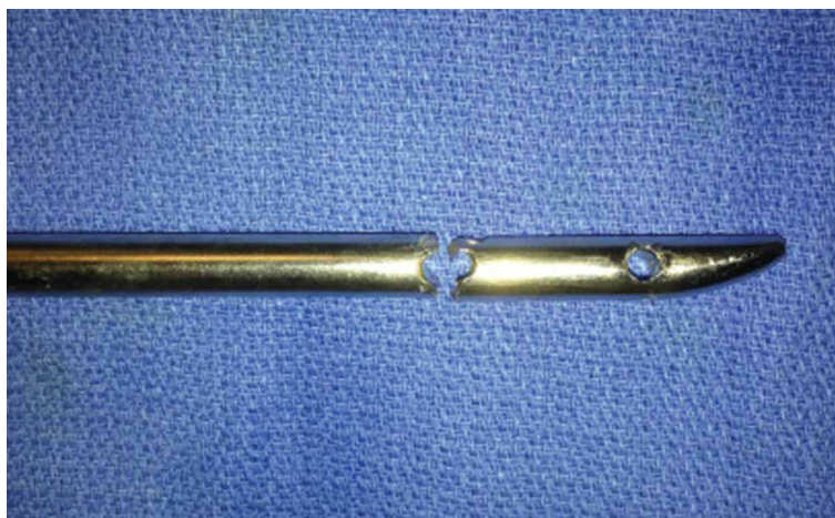
Figure 2. Intraoperative photograph of removed portions of solid nail, which had broken at proximal distal cross-lock.

distal nail fragment is required in order to facilitate manipulation through the metaphyseal bone. This technique is more readily used within the distal femur, given the large metaphyseal volume, in contrast with the distal tibial metaphysis. Giannoudis and colleagues 1 described a method (for both tibia and femur) in which the intramedullary canal was