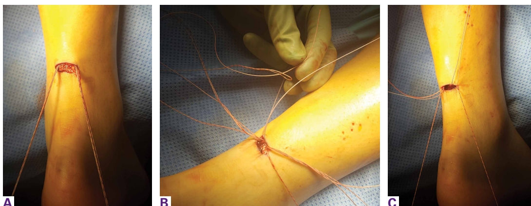
Figure 2. (A) Clamp and jig are removed through incision, and all suture pairs are pulled distally to ensure fixation and control of the proximal tendon. (B) Sutures are looped around each other and passed on both sides of the tendon to leave 2 non-locking sutures and 1 locking suture on either side of the tendon. (C) Each suture in each final pair is individually tensioned to remove any suture creep and to recheck proximal fixation.

tendon in the paratenon. Proper jig placement should be smooth and encounter little resistance. The proximal tendon is in a superficial location and can be palpated within the prongs of the jig to double-check that the tendon is centered within the jig. A frequent error is to insert the jig too deep, which subsequently causes needles and sutures to miss the tendon and pull through.