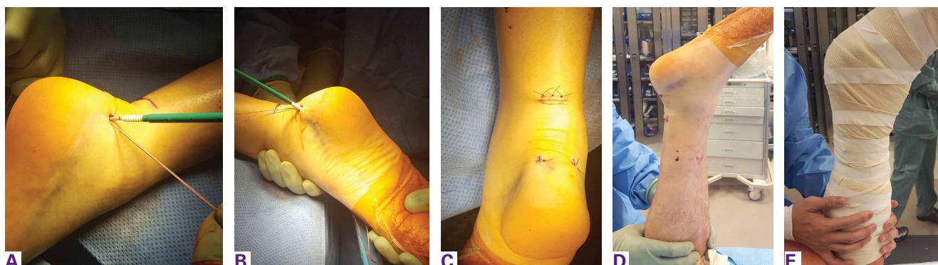
Figure 4. (A) Ankle is plantar flexed to appropriately tension Achilles tendon and is held in place by an assistant. Sutures are passed through the eyelet of SwiveLock anchor (Arthrex), and the anchor is gently malleted into calcaneal drill hole and hand-tightened until flush with bone. (B) Process is repeated for insertion of other SwiveLock anchor. (C) Paratenon repair with absorbable sutures is followed by subcutaneous and skin closure. (D) After final repair, resting ankle plantar flexion is assessed and Thompson test performed. (E) Non-weight-bearing plantar flexion splint is worn for the next 2 weeks to allow for incision and initial tendon healing.

are passed through the eyelet of the SwiveLock anchor, and then the anchor is gently malleted into the calcaneal drill hole and hand-tightened until flush with bone. Often, squeaking can be heard as the anchor reaches its final depth in bone.