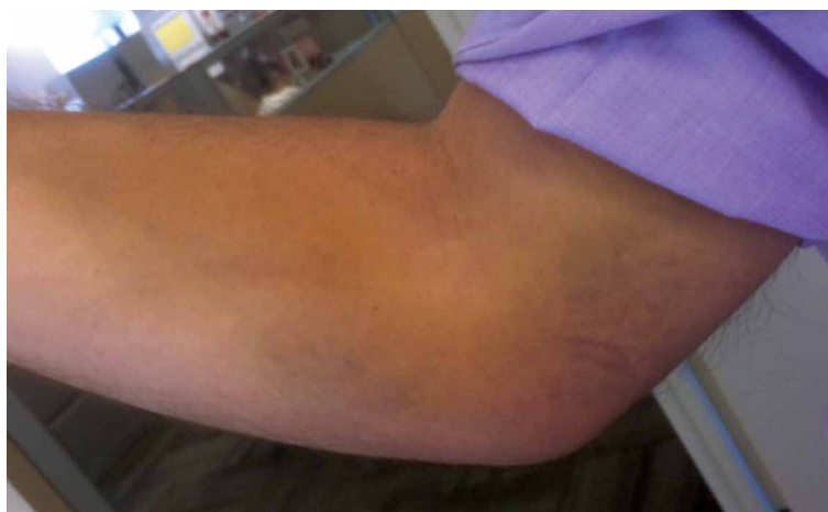
Figure 1. Medial elbow with non-gravity-dependent ecchymosis over course of pronator teres muscle, 3 days after injury.

Authors' Disclosure Statement: The authors report no actual or potential conflict of interest in relation to this article.