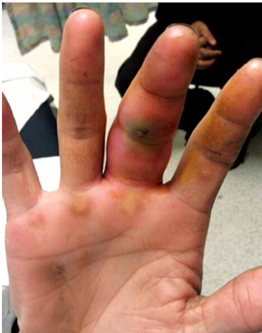
Figure 1. Typical clinical examination findings of digit with pyogenic flexor tenosynovitis from local inoculation. Note fusiform swelling and flexed posture with surrounding erythema.

Kanavel 1 initially described 4 cardinal signs that characterize infection of the flexor tendon sheath: symmetric fusiform swelling of the entire digit, exquisite tenderness to palpation along the course of the tendon sheath, semiflexed posture at rest, and pain with attempted passive extension of the digit. The prevalence of this infection ranges from 2.5% to 9.4%. 2 Once the infection is established in a patient, it can cause significant morbidity and disability and produce an economic burden. It can also present a significant treatment dilemma for the treating surgeon, as there is no standardized protocol for