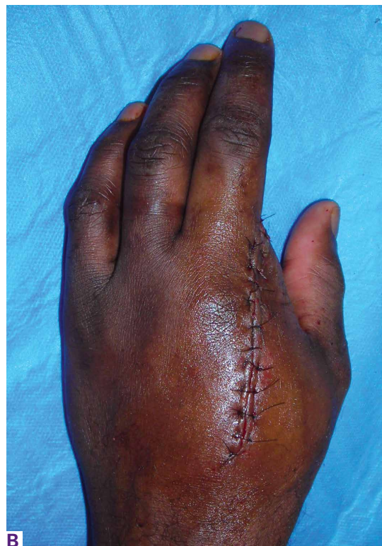
Figure 3. Despite multiple débridements, (A) this case of index-finger pyogenic flexor tenosynovitis (PFT) resulted in (B) amputation (ray resection). The patient had presented late, after several days of having symptoms with subcutaneous purulence and early signs of digital ischemia. Initial surgical exploration confirmed septic rupture of flexor tendons, as can be confirmed by extended resting posture of the digit, rather than typical flexed posture, as in most cases of PFT.