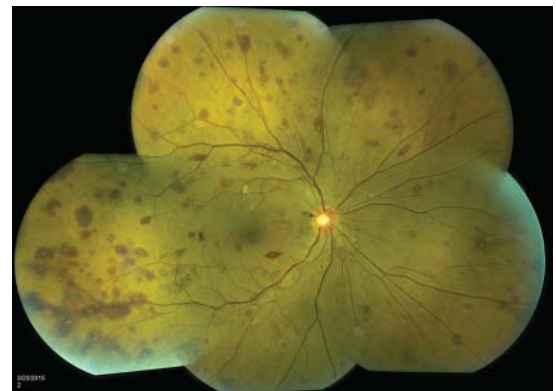
FIGURE 4. Wide view of multiple Roth spots.

episodes of epistaxis. Vital signs were within normal limits except for a heart rate of 110 beats per minute. Physical examination revealed pale conjunctivae and bilateral white-centered retinal hemorrhages and microaneurysms (Figures 1–4).