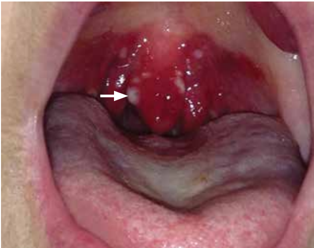
FIGURE 1. The uvula was swollen and red, with exudate (arrow).