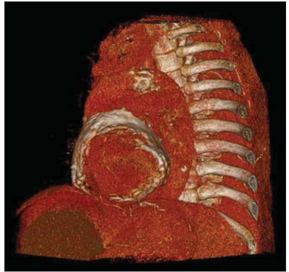
Constrictive pericarditis occurs in up to 4% of patients with end-stage renal disease