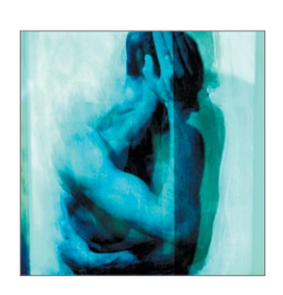
Depression and chronic pain