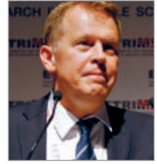
Jens Kuhle, MD, PhD

BERLIN —Levels of neurofilament light chain (NfL) indicate that patients with secondary progressive multiple sclerosis (MS) have more ongoing neuronal loss than patients with primary progressive MS of comparable age, both in the presence and in absence of gadolinium enhancing lesions, according to research presented at the 2018 annual congress of the European Committee for Treatment and Research in Multiple Sclerosis (ECTRIMS). In secondary progressive MS and primary progressive MS, NfL may serve as a prognostic marker of brain atrophy, said the investigators.