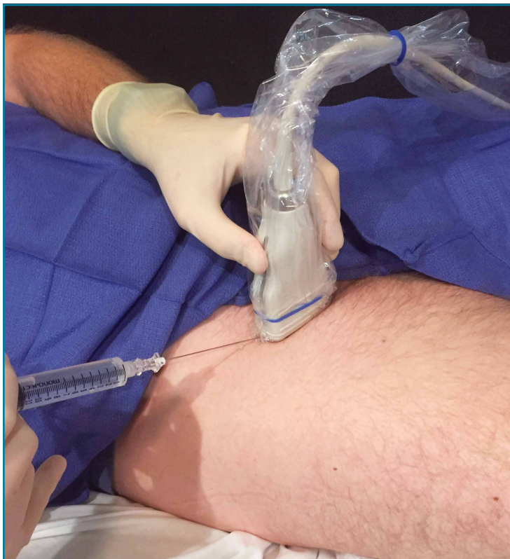
Figure 3. Photo demonstrating the correct probe position over the femoral crease for visualization of the femoral nerve.