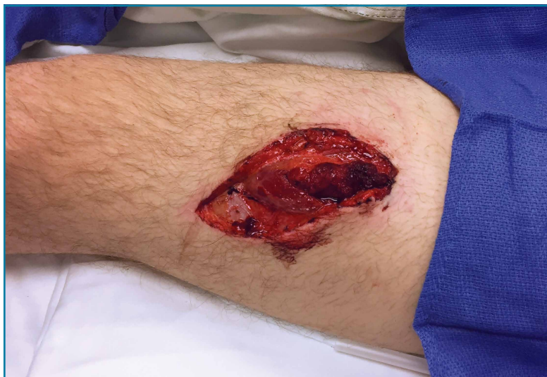
Figure 1. Photo of the laceration to the patient's anterior thigh.

Femoral nerve blocks are useful in a variety of clinical scenarios, including fractures of the femur or hip 1 and laceration repairs ( Figure 2 ). Although a fascia