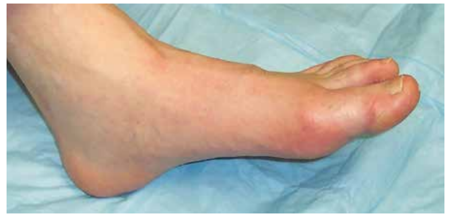
The first metatarsophalangeal joint is the most common site for acute gout attacks, known as podagra.

that compared glucocorticoids with NSAIDs.<sup>8</sup> Thus, without further study, treatment choices made by HCPs are often guided by factors other than the existence of robust evidence.