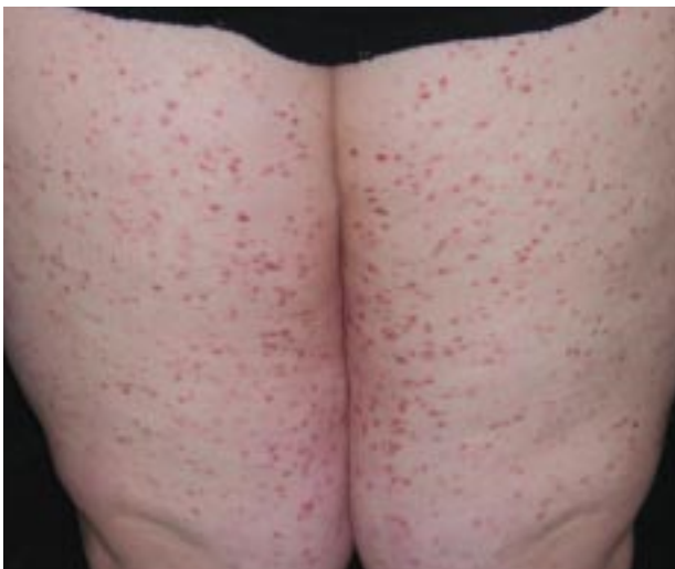
Figure 1. Patient's legs reveal typical morphologic lesions of urticaria pigmentosa.

While most forms of mastocytosis are limited to the skin, systemic involvement can occur. Mast cells can accumulate in the bone marrow. 3 This indolent form of mastocytosis has a favorable prognosis and can present with pruritus, flushing, palpitations, tachycardia, headaches, syncope, gastrointestinal symptoms, cognitive dysfunction, and osteoporosis. 1,3 Ten percent of patients with systemic mastocytosis may develop non-mast cell lymphoma or leukemia. Mast cell leukemia rarely occurs and represents the most severe variant of mastocytosis. 3