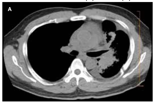
FIGURE 1 Chest Computed Tomography Showing Tumor Response to Crizotinib Between 2 (A) and 7 (B) Months After Diagnosis

those that are resistant.<sup>3</sup> In 2004, somatically acquired mutation of the EGFR gene was found to be associated with response to EGFR tyrosine kinase inhibitors such as gefitinib and erlotinib, and subsequently it was shown that patients without these mutations derived no benefit from use of these drugs.<sup>4</sup> Thus, the precision oncology paradigm is using a molecular diagnostic as part of the indication for an antineoplastic agent, resulting in improved therapeutic efficacy and often reduced toxicity.