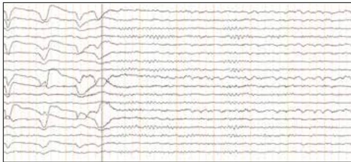
FIGURE 2 Sample segment of Electroencephalogram

Sample segment of electroencephalogram in a longitudinal bipolar montage showing normal awake background with a posterior predominant rhythm of 9 Hz. Bandpass filtered 1-70 Hz, Notch filter 60 Hz. Scale bar at the lower left depicts sensitivity and time scale.