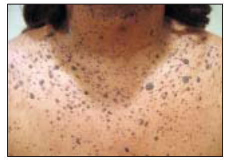
This patient—like the others in the study—was distressed by her lesions.