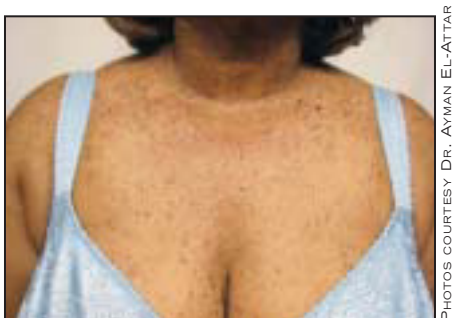
Significant clearance can be seen after treatment with the 532-nm laser.

PROFESSIONAL BRIEF SUMMARY - See package insert for full prescribing information