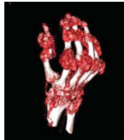
The 3-D DECT image shows numerous tophi in the same patient.