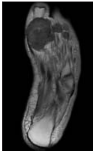
This proton density image shows a low to intermediate signal tophus.

In a phase III clinical trial, 81% of pa-