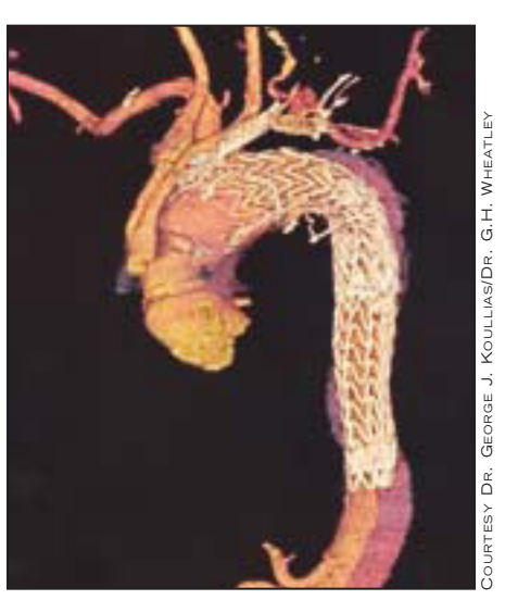
A hybrid approach was used in this patient with a type A aortic dissection.

A total of 55 studies, comprising 28 retrospective studies and 27 case reports, was identified. These included 582 patients (412 men and 170 women). Based on sample size criteria, a final total of 15 studies with 463 patients (320 men and 143 women) was included in the metaanalysis. The 40 remaining studies included up to 119 patients (92 men and 27 women) and comprised case reports and small retrospective studies (fewer than 11 patients per study). These were analyzed descriptively, according to Dr. Koullias of a cardiac surgery practice in Peoria, Ill., and his colleague, Dr. G.H. Wheatley of a cardiac group practice in Phoenix.