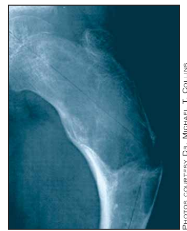
The appearance is "lytic," compared with normal bone.

fracturing continues into adulthood. Among all potential predictors examined, only renal phosphate wasting was a significant predictor: Phosphaturia was associated with both an earlier age of first fracture (5.1 vs. 16.6 years) and a greater lifetime fracture rate, of 0.35 vs. 0.08 fractures/year (J. Bone Miner. Res. 2004;19:571-7).