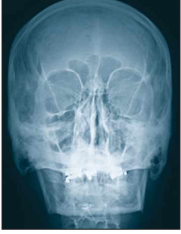
Radiograph shows fibrous dyplasia in craniofacial bone.

Scoliosis is another common and frequently unrecognized complication of FD. Whereas earlier literature had suggested that the spine was rarely involved in FD, a retrospective review of bone scans from 62 patients with polyostotic disease revealed spinal lesions in 63% and scolio-